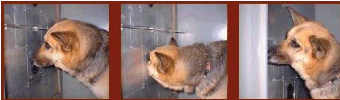
Figure 1. A dog in the experimental chamber first hears a specific sound (left), sticks her nose into a glass cylinder, in which various odours are presented (middle), and then presses one of the two levers with her snout to indicate whether she had smelled clean air or the target odour (right).

In a natural situation, the dog must distinguish the odour of TNT or DNT from many other odours extraneous to the target odour. In so-called “masking experiments” at the IBDS, again in the same experimental chambers, target odors were presented to the dogs in combination with numerous other substances. The results indicated that dogs detect very low relative concentrations of target odour in the presence of strong masking odours (Waggoner et al. 1998). At a target odour concentration of about 1 ppb, the concentration of the masking odour needed to be at about 20 ppm before detection performance began to be affected (a ratio difference of more than 3 orders of magnitude, or one in 1000). Even then, the effect was a decline in performance, not a complete loss of detection skills. As with experiments on detection thresholds by Phelan and Barnet (pers. comm.), considerable variation was found among individual dogs.